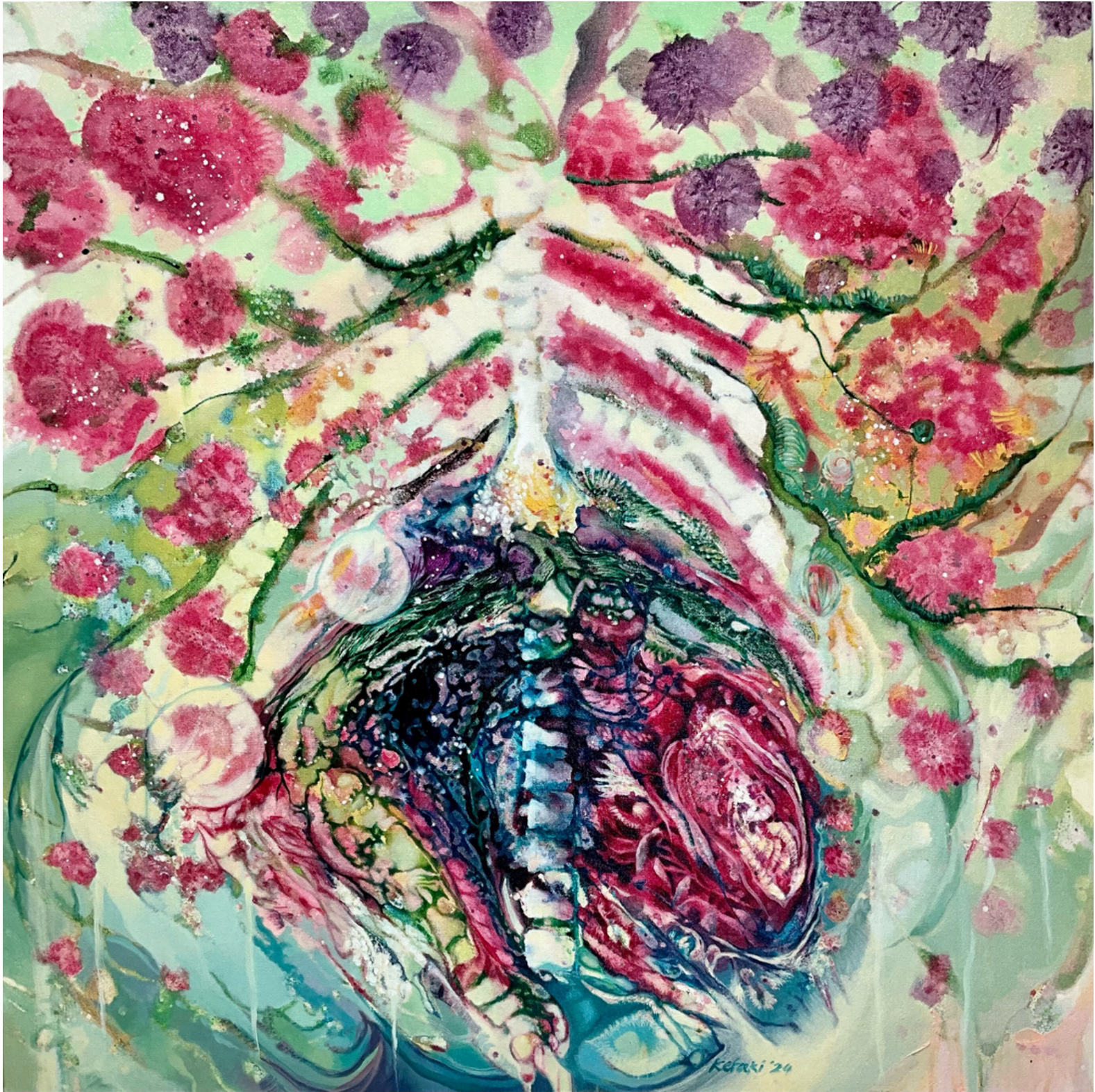
KETAKI PIMPALKHARE BECAUSE I COULD NOT STOP FOR DEATH ACRYLIC ON CANVAS 36" X 36" 2024 INR 2,25,000 + GST