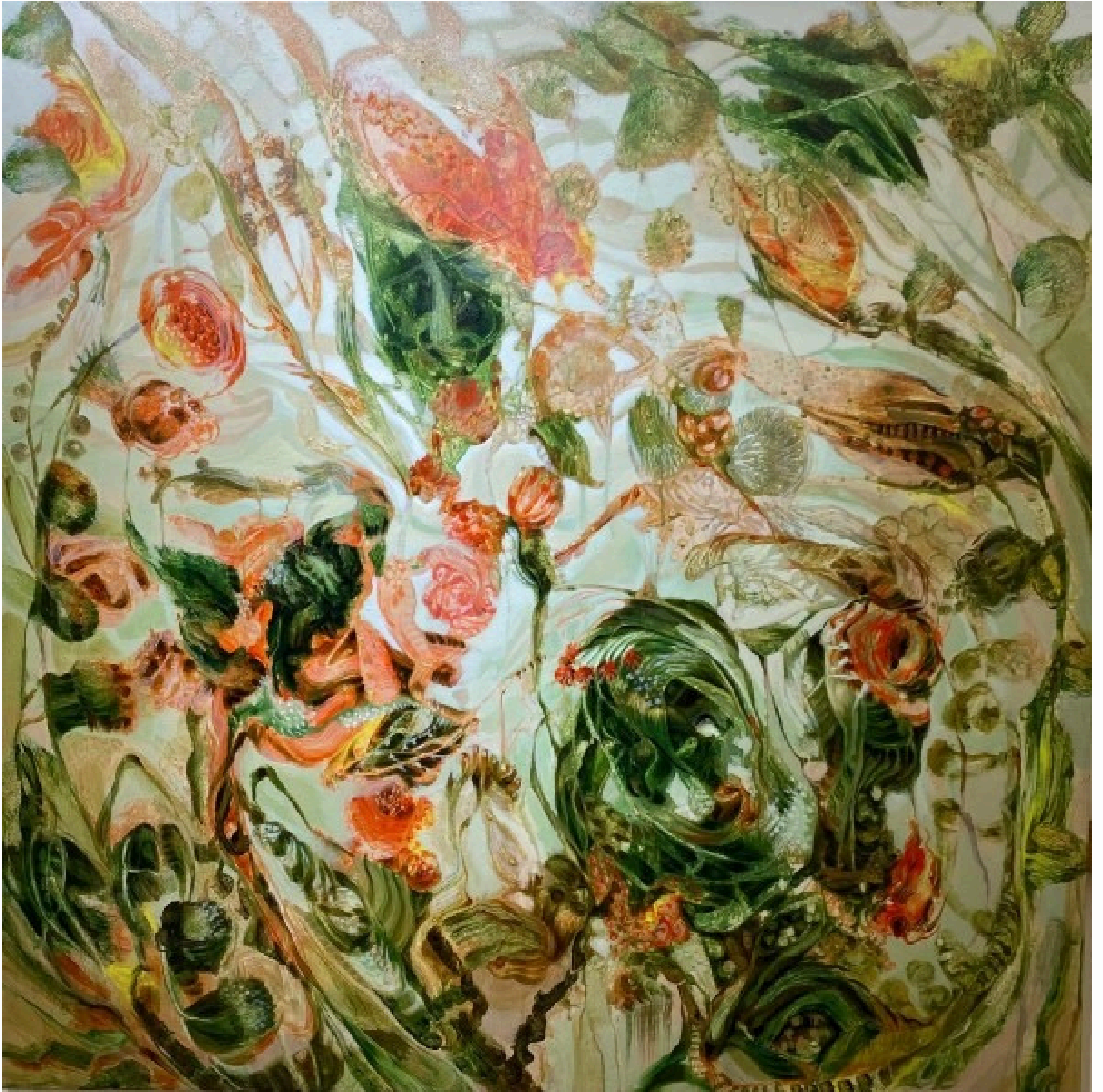
KETAKI PIMPALKHARE ENCHANTED ACRYLIC ON CANVAS 48" X 48" 2024 INR 4,00,000 + GST