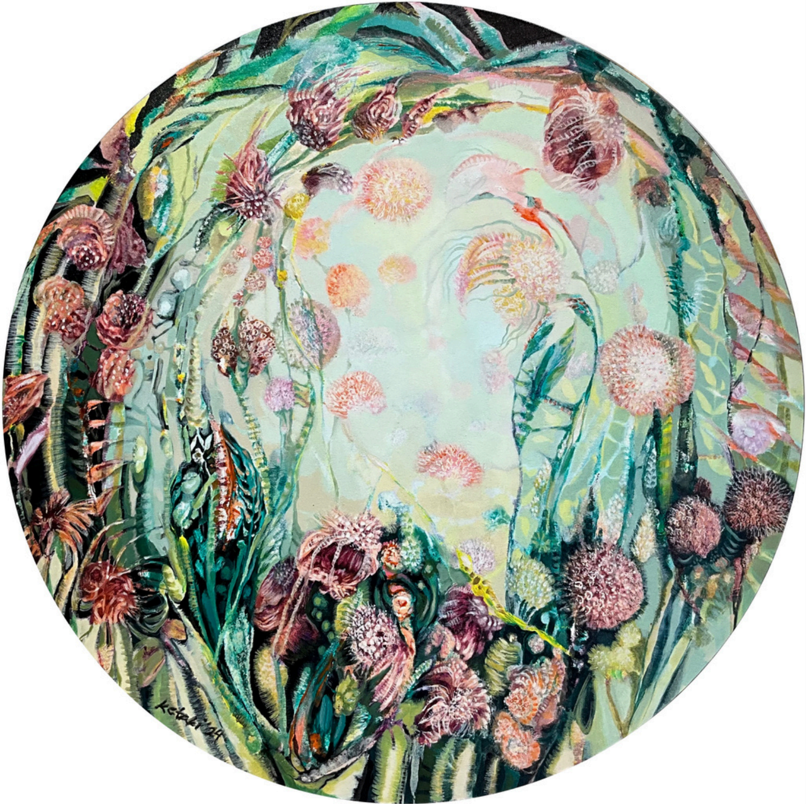
KETAKI PIMPALKHARE DANDELION ACRYLIC ON CANVAS 36" DIAMETER 2024 INR 2,25,000 + GST