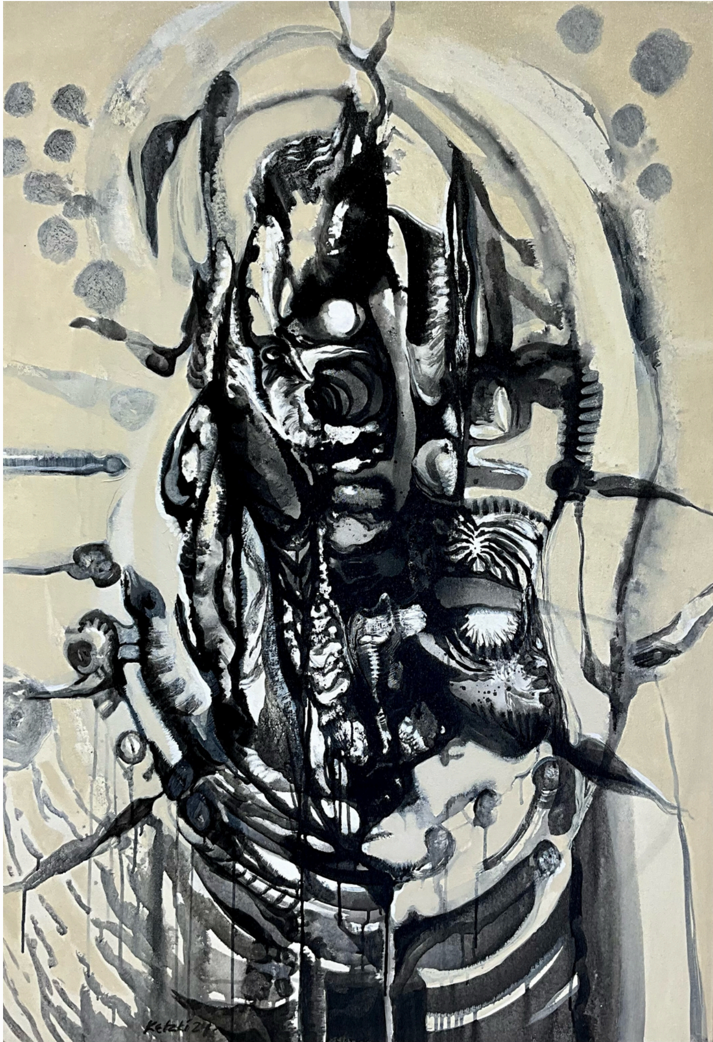
KETAKI PIMPALKHARE INVICTUS ACRYLIC ON CANVAS 52" X 36" 2024 INR 3,25,000 + GST