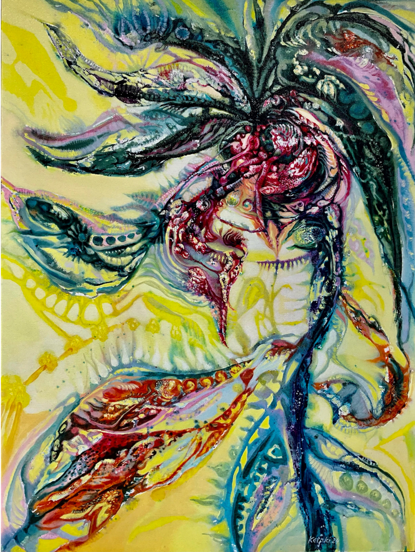
KETAKI PIMPALKHARE OREAD ACRYLIC ON CANVAS 48" X 36" 2024 INR 3,00,000 + GST