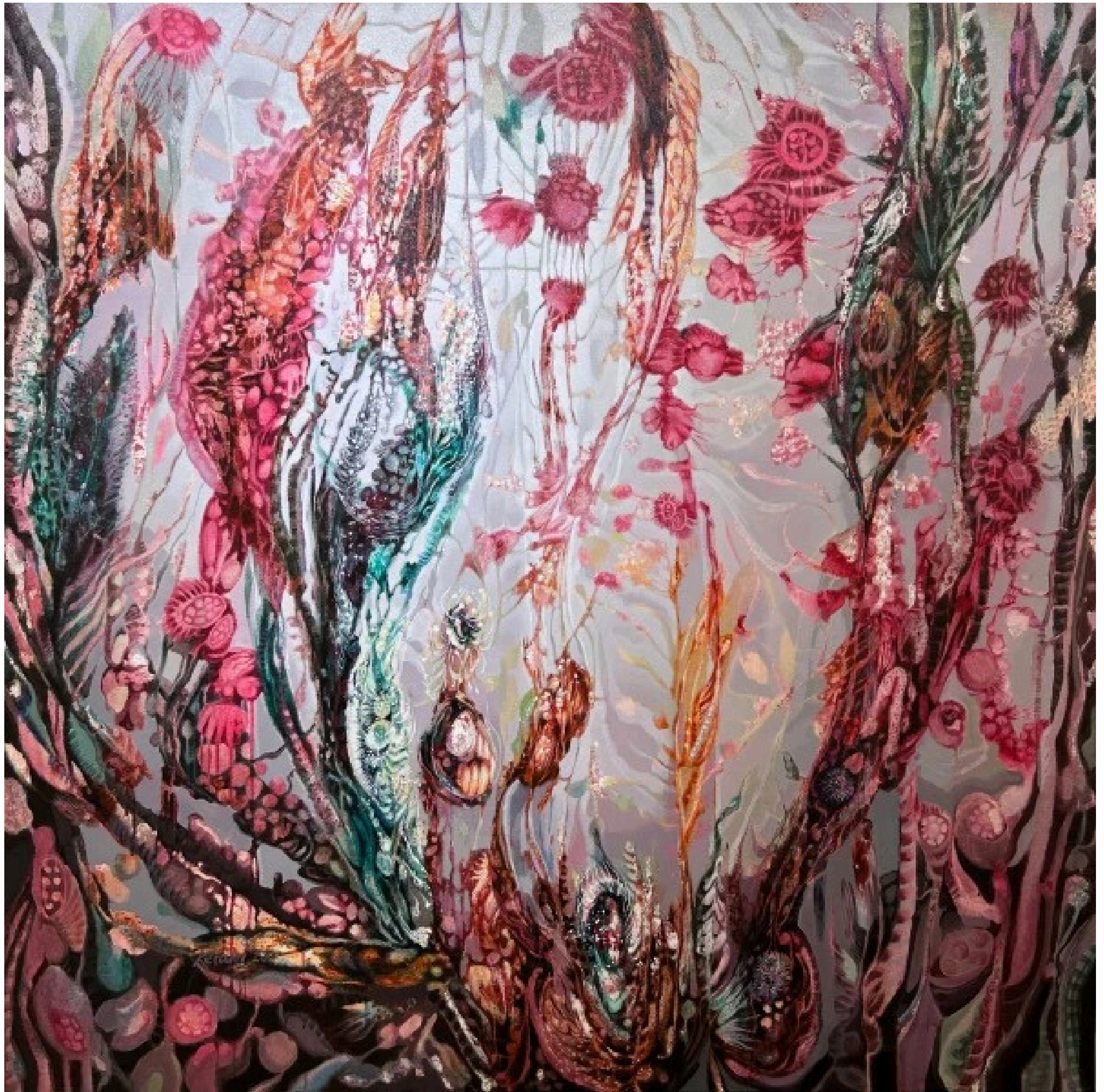
KETAKI PIMPALKHARE ENTANGLED ACRYLIC ON CANVAS 60" X 60" 2023 INR 6,00,000 + GST