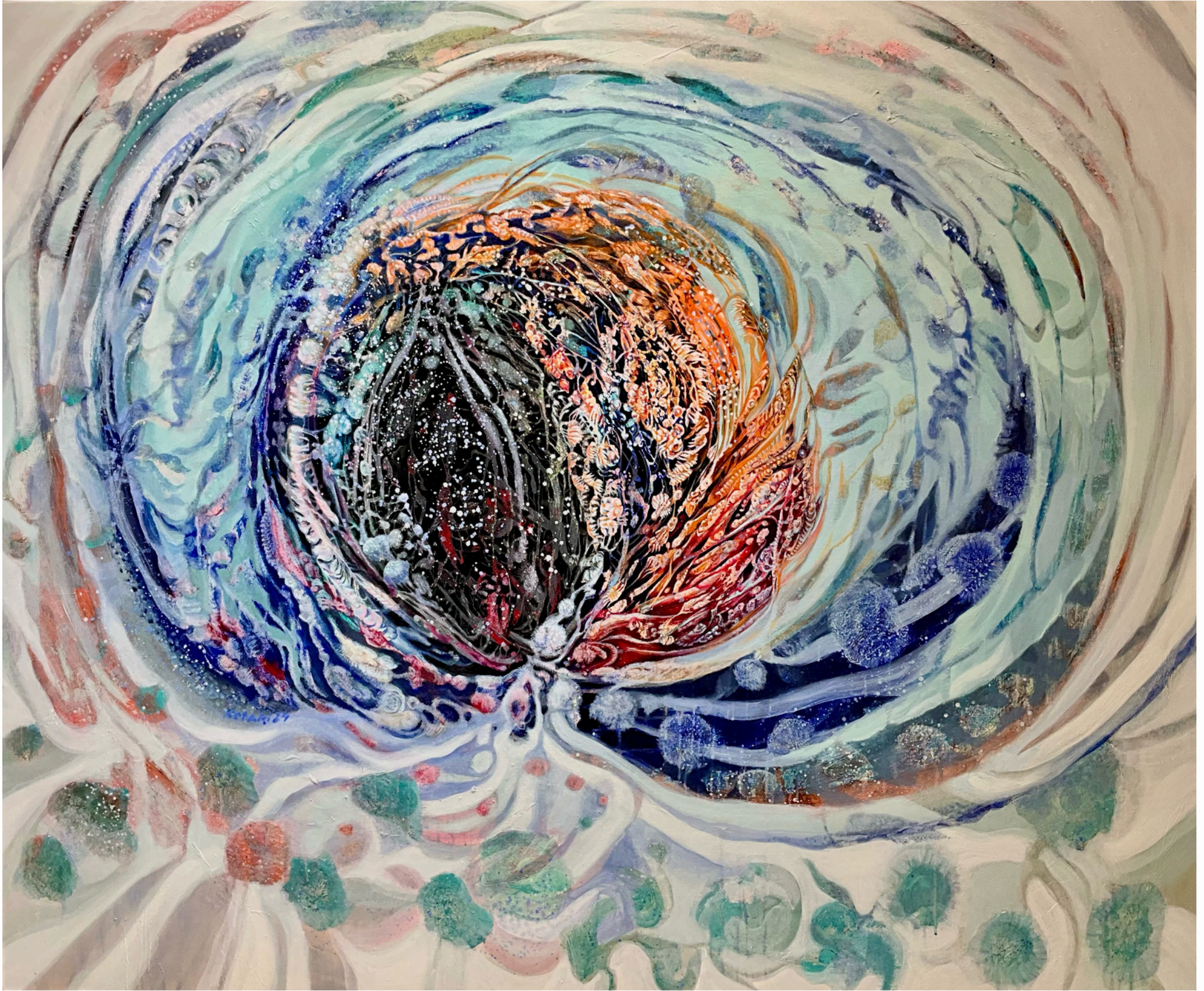
KETAKI PIMPALKHARE THE ROAD NOT TAKEN ACRYLIC ON CANVAS 60" X 72" 2024 INR 7,00,000 + GST