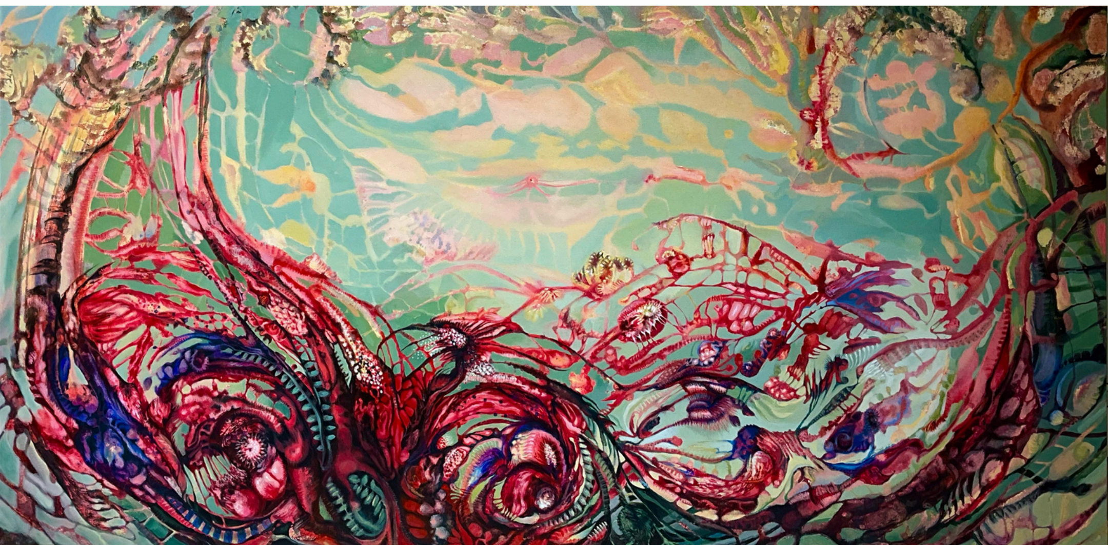
KETAKI PIMPALKHARE THE WAY THROUGH THE WOODS ACRYLIC ON CANVAS 36" X 72" 2024 INR 4,30,000 + GST