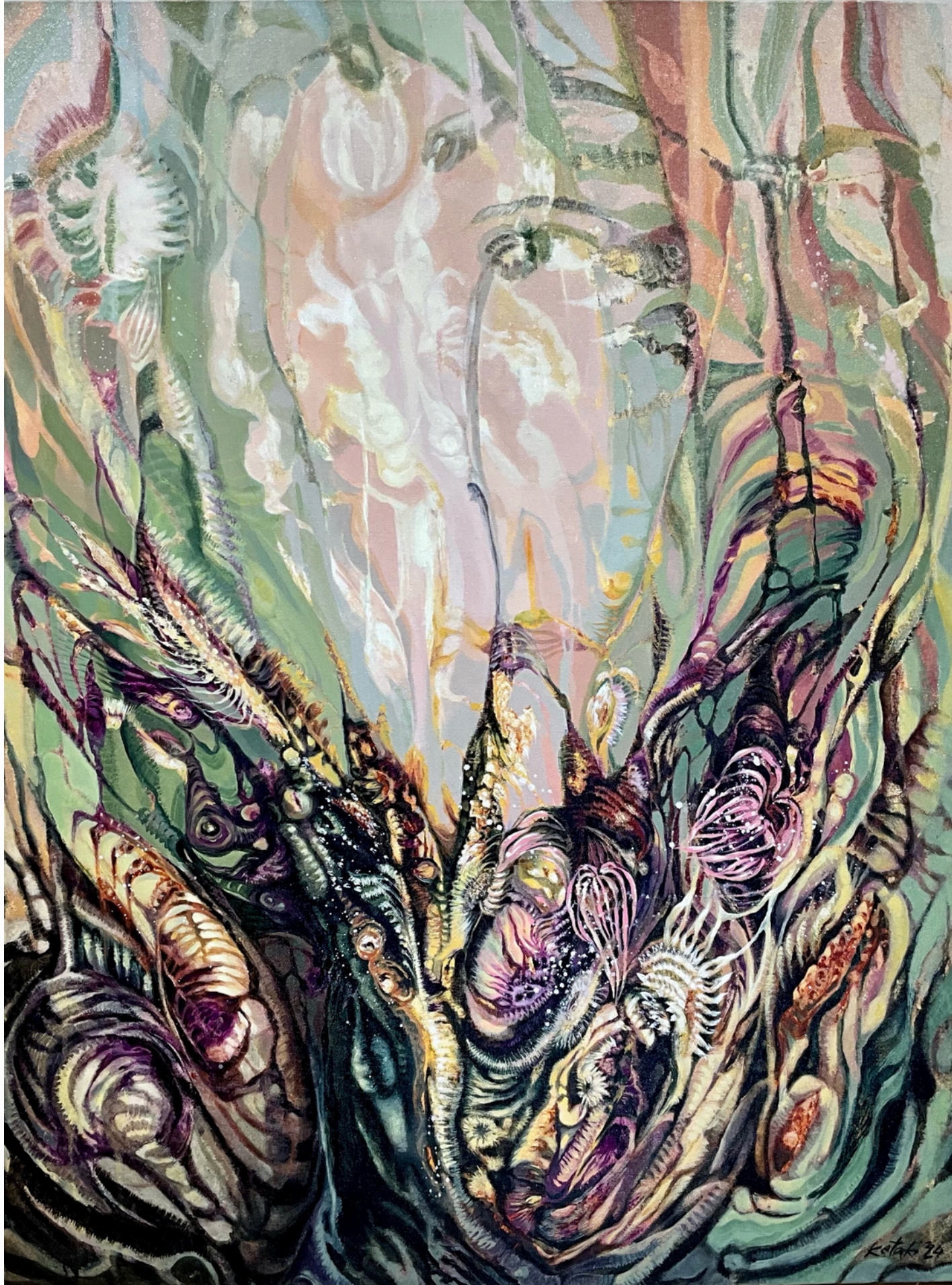
KETAKI PIMPALKHARE A POISON TREE ACRYLIC ON CANVAS 48" X 36" 2024 INR 3,00,000 + GST